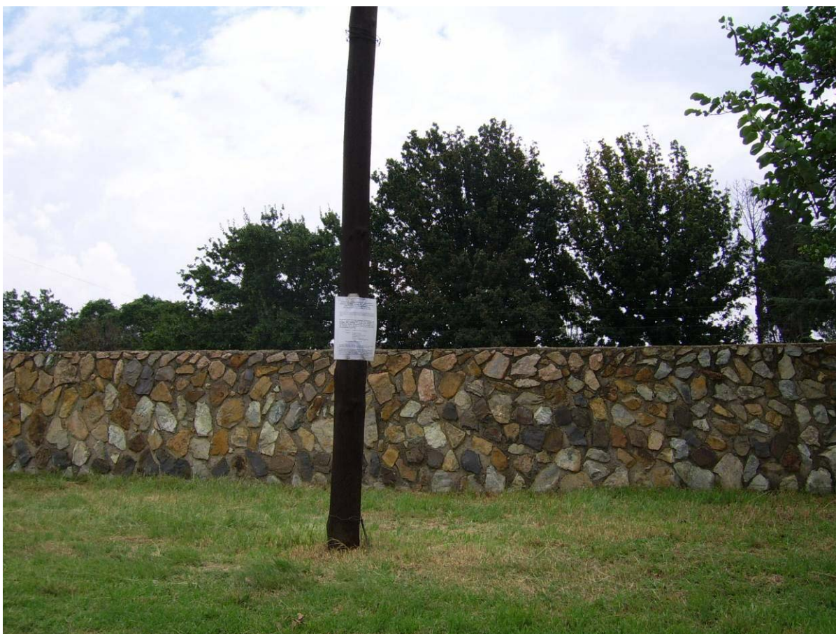
Figure E.2. Photographs of two EIA notices at proposed development site.