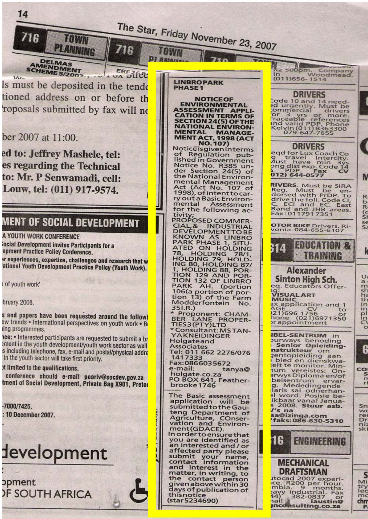
Figure E.3. Newspaper notice in town planning section in The Star (Friday, 23 November 2007).